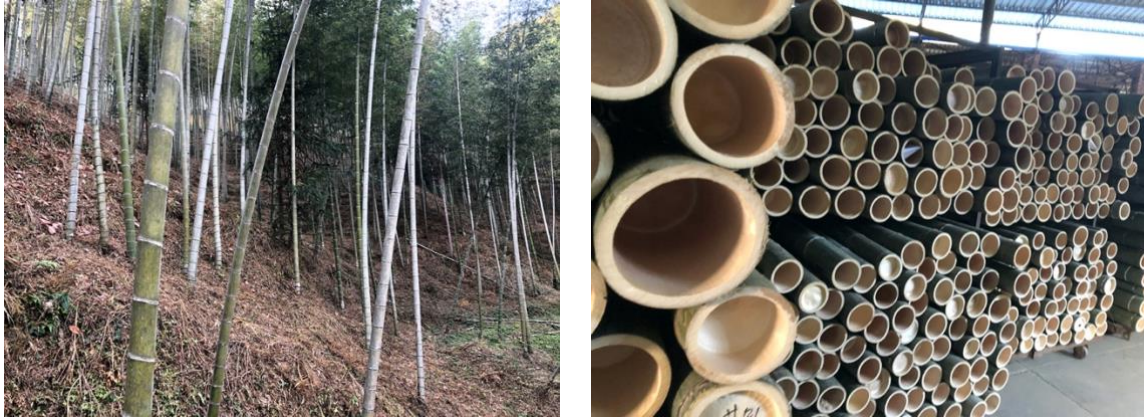
Figure 2 Bamboo culms and rough processing site near plantations

3 to 5 years old), and afterwards it should be cured and dried properly for further treatment and manufacturing purpose. Harvesting is best taking place at the end of the dry season, and a few months prior to the start of the rainy season.