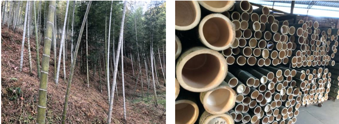
Figure2 Bamboo culms and rough processing site near plantations

Bamboo Industrial parquet are floorings made from 100% pure bamboo. The loose bamboo strips are cut into length and bundled in a block with adhesive tape. The look is sharp with straight lines and a warm glow, yet creating an infinity look. Produced from bamboo specie "Phyllostachus Pubescens", origin China.